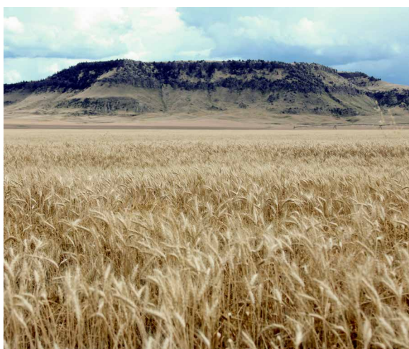
Rocky Boy's Reservation located in north central Montana.