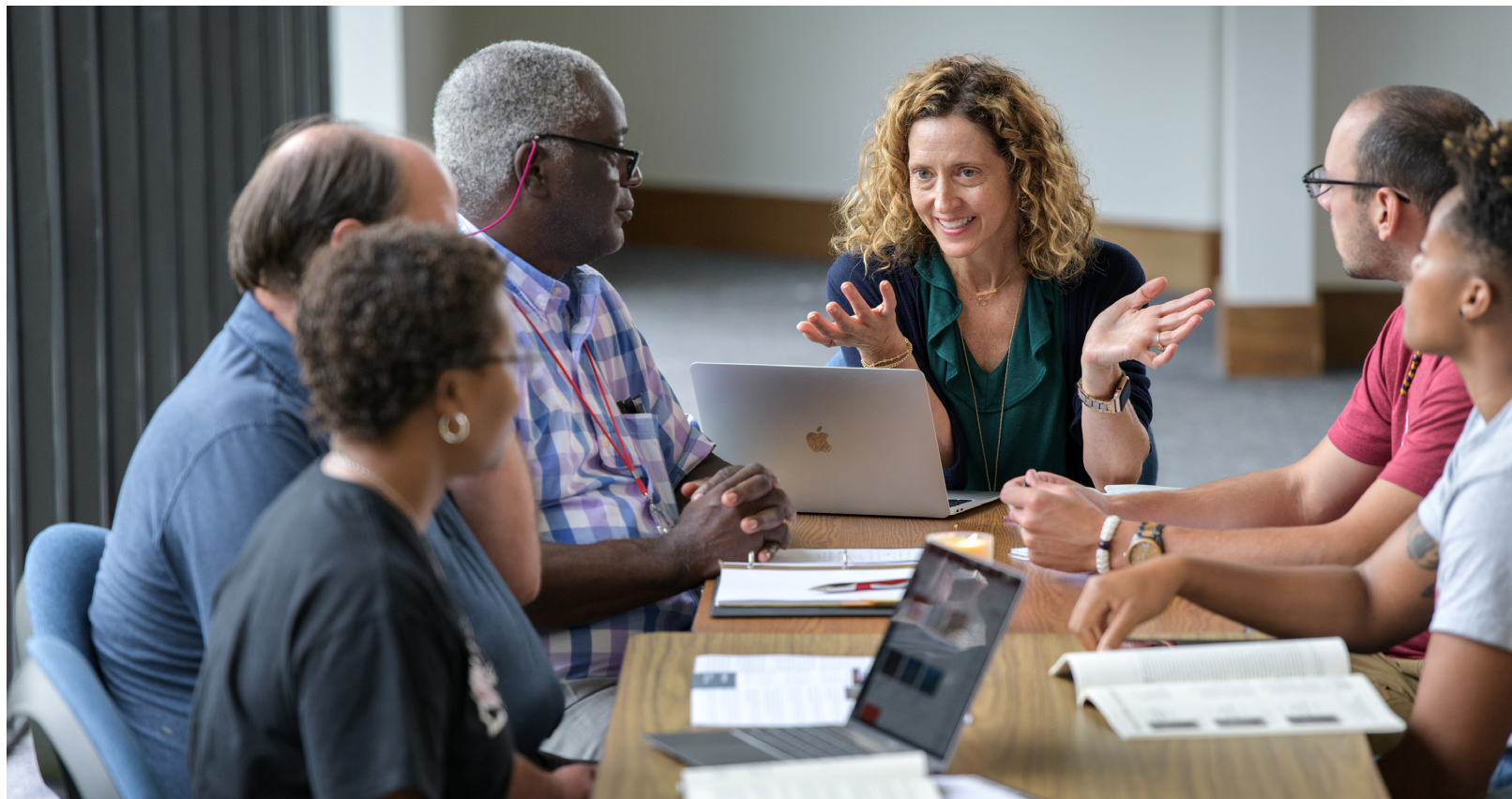
The seminary has adopted a new strategic plan for 2022-2025 to help revise program learning outcomes, update program curricula and make programs available to all students — residential, commuter and distance ed.