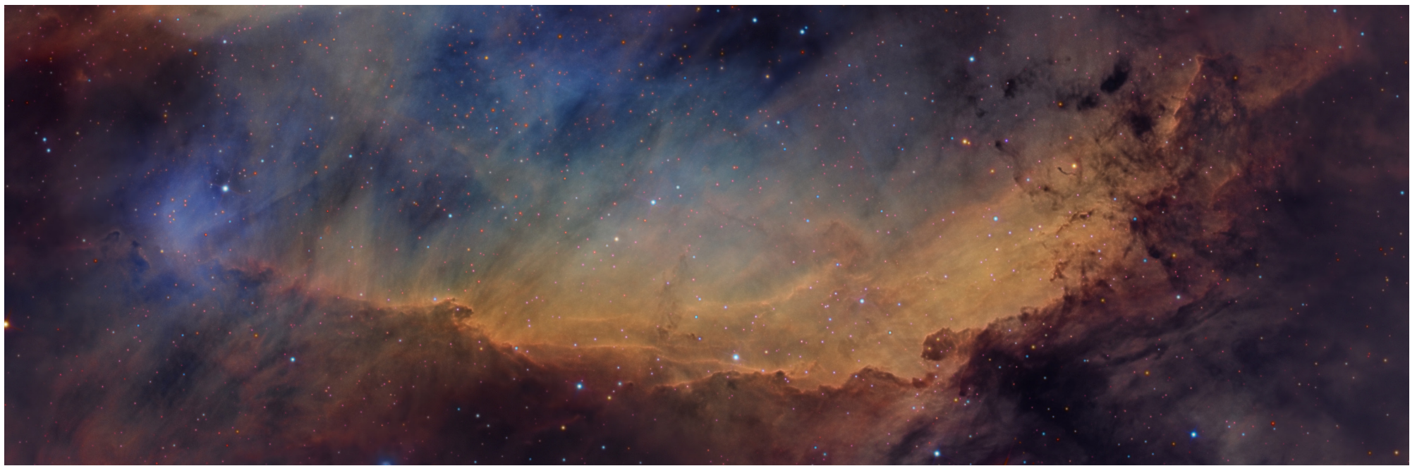
The cloud of dust and hydrogen is being pulled together in a process that will create more than a star.