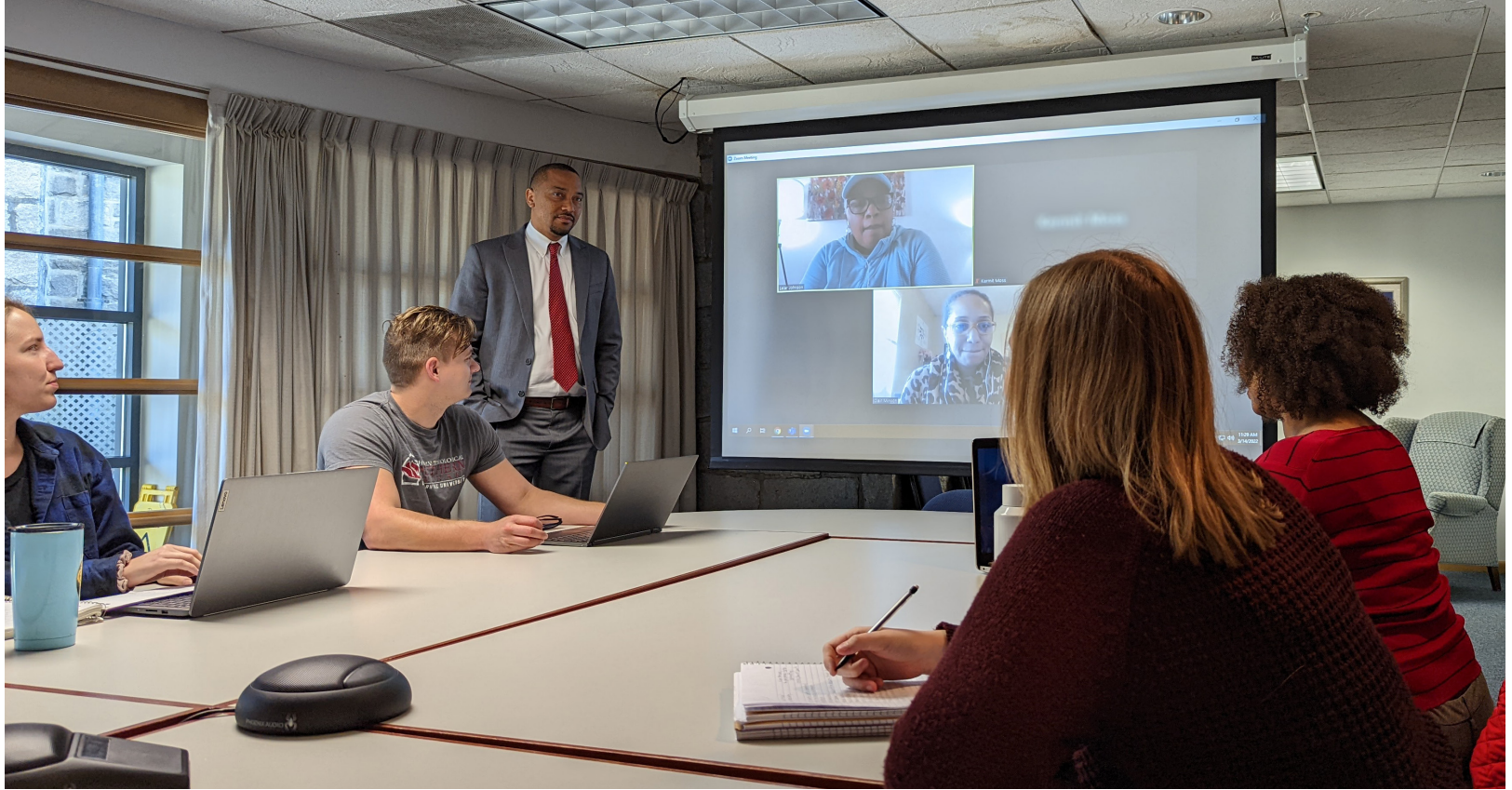
In fall 2022, the seminary will expand its academic outreach by offering divinity graduate students the opportunity to complete the curriculum in a hybrid format.