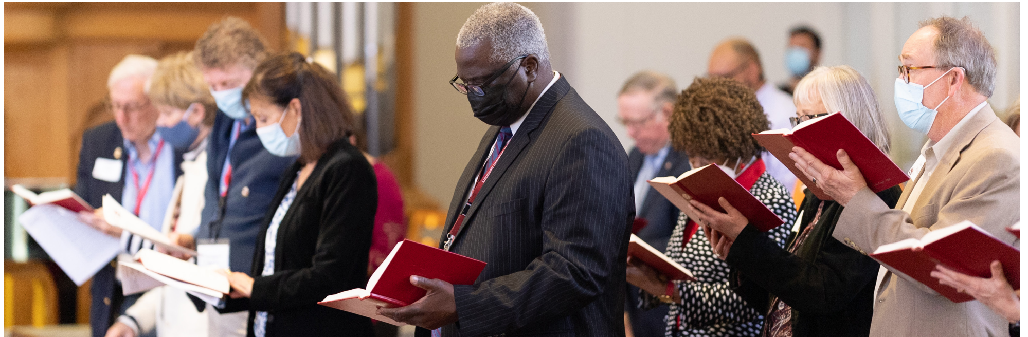
Students, alumni and friends gather at Alumni Day, lifting their voices and hearts together in celebration of the common bond they share in Jesus Christ.